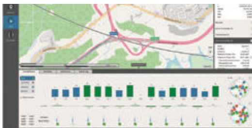
Some of its many innovations include a user-friendly interface, powerful and documented API, and intuitive automation tools.