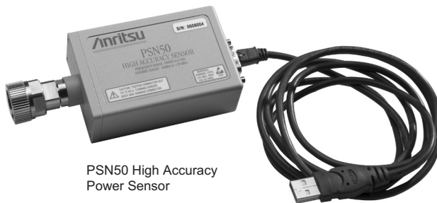
PSN50 High Accuracy Power Sensor

Total RSS Measurement Uncertainty (0 to 50° C): ±0.16 dB* Noise: 20 nW max Zero Set: 20 nW Zero Drift: 10nW max** Sensor Linearity: ±0.13 dB max Instrumentation Accuracy: 0.00 dB Sensor Cal Factor Uncertainty: ±0.06 dB Temperature Compensation: ±0.06 dB max Continuous Digital Modulation Uncertainty: +0.06 dB (+17 to +20 dBm)