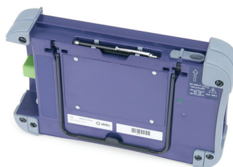
E6100 Fiber module carrier