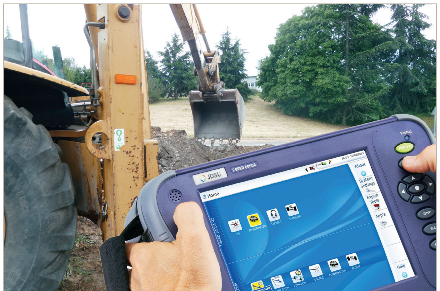
Portable and upgradeable platform with interchangeable test modules increases technician productivity

The flexibility of interchangeable module carriers and various plug-in modules let users create a platform that meets today's specific testing needs and yet it can evolve seamlessly to meet tomorrow's ever-changing network requirements.