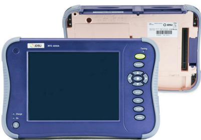
Back of the module carrier where other modules are attached

The multidimensional design of the T-BERD/MTS-6000A (V2) provides optimal configuration flexibility with extended battery life. The E6100 module carrier is best suited for fiber applications; whereas, the high-powered battery in the E6200 module carrier extends battery life when used with the carrier Ethernet (MSAM) or other intensive fiber applications.