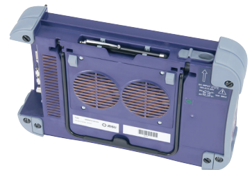
E6200 MSAM and Fiber module carrier