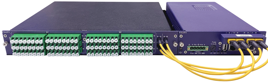
FTH-5000 with a 48 port (Test Access Point) TAP and 48 port MPO switch