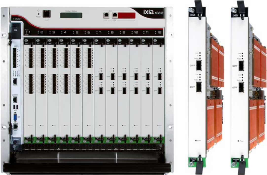
XGS12-HS Chassis and PerfectStorm 40GE Load Modules

A single, integrated system equipped with 12 PerfectStorm blades, allows control of application traffic to nearly a terabit, up to 720 million concurrent connections, and new TCP connections rates of up to 24 Million. The hardware-based acceleration supports massive encryption levels with up to 240Gbps of SSL traffic and 480Gbps of IPsec traffic per system. The system uses inline field programmable gate arrays (FPGAs) for enhanced accuracy pertaining to latency measurements with a resolution of 10ns.