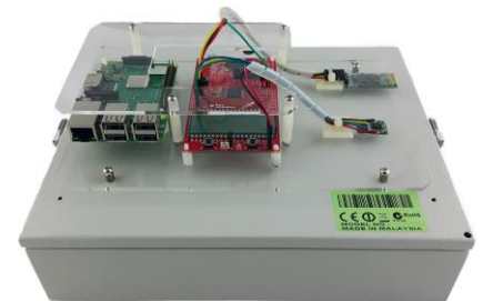
The Development kit

Code Composer Studio Software Development Kit (SDK).