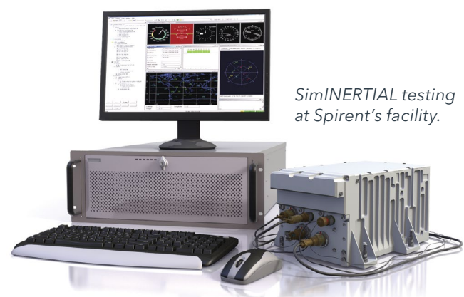
SimINERTIAL testing at Spirent's facility.

Spirent's SimINERTIAL architecture is also available in configurations to support transfer alignment and multiple sensor architectures.