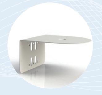
710452 - AllDisc bracket