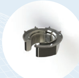
710598 - Slitted nut