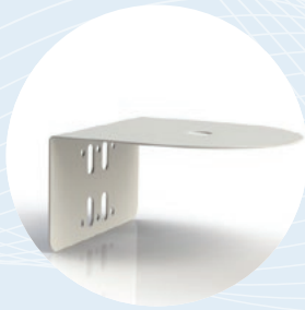
710452 – AllDisc bracket