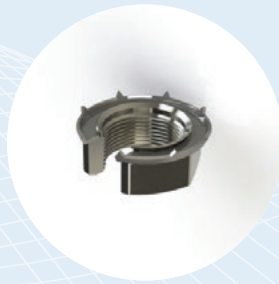
710598 – Slitted nut